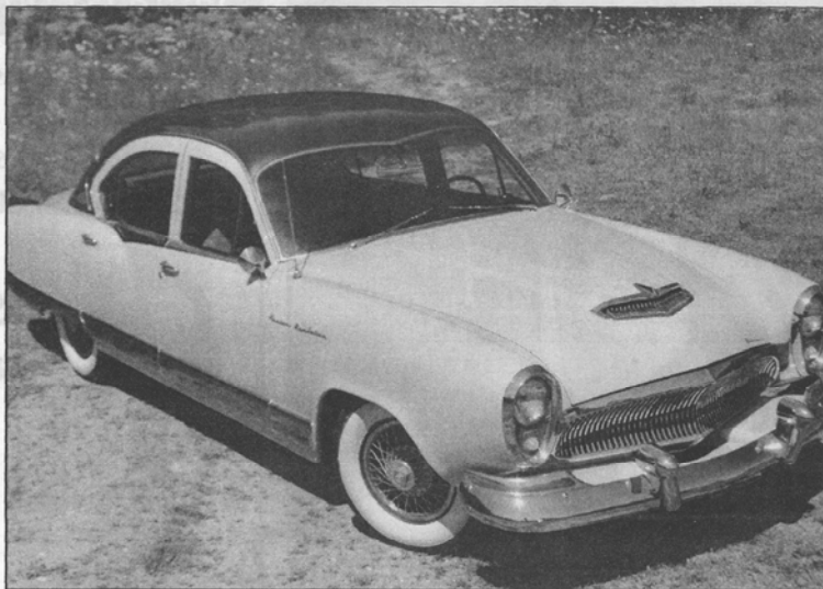
The recently re-acquired 1954 Kaiser has been returned to its original owners in Columbia.